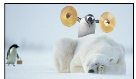
This is for eating my brother!